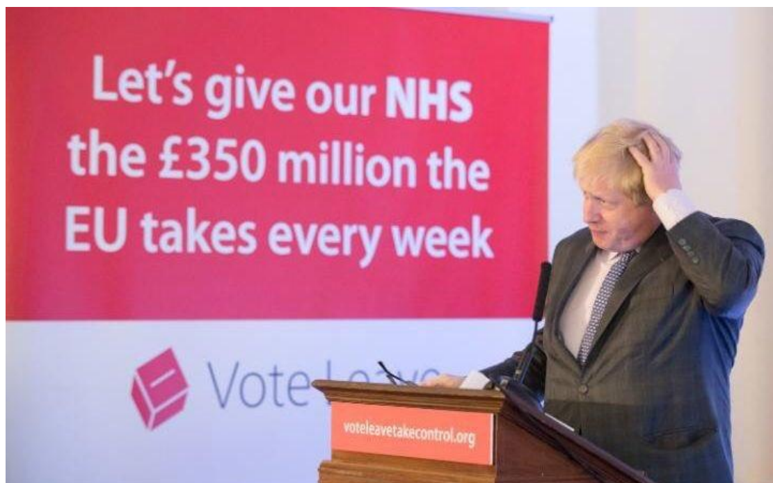
Boris Johnson in front of a Leave poster. Keep for future reference.