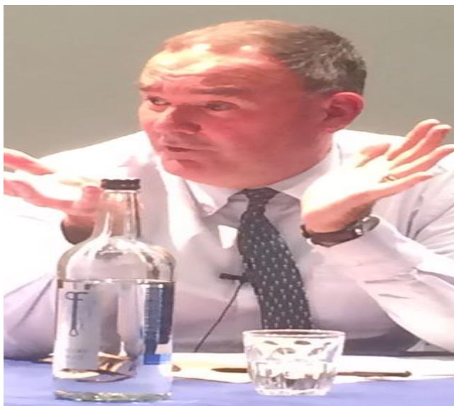
Jon Cruddas in full flow

Friday 21 st October 7.30 pm we welcome back Jon Cruddas MP for Dagenham and Rainham. Jon will be speaking on “Labour Together” and probably the impact of the leadership election.